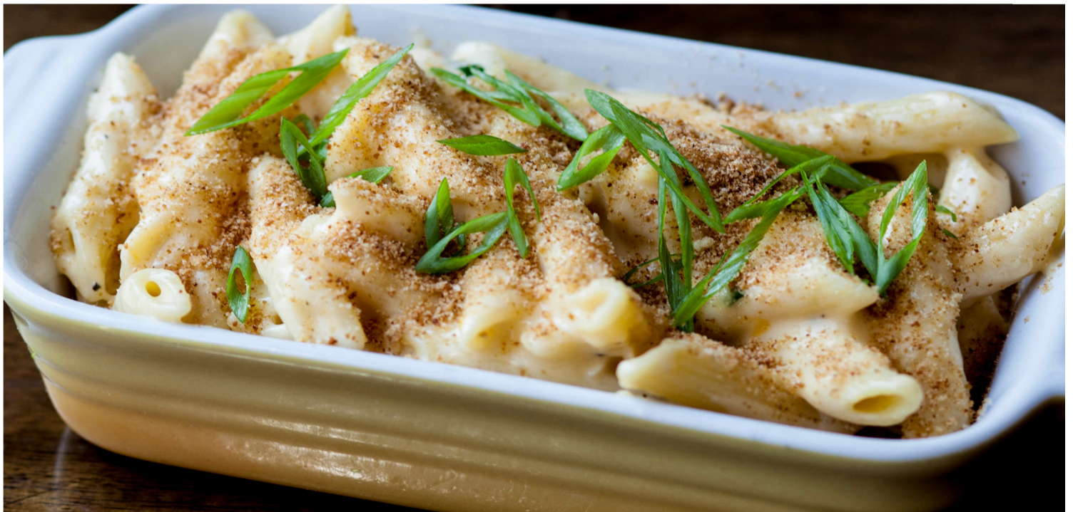
Four Cheese Mac & Cheese

fresh mixed seasonal vegetables $4.20 per serve