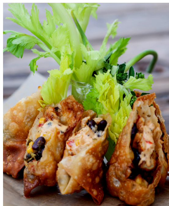
Chicken & Black Bean Wontons